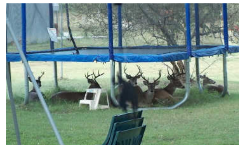
Why trampolines are not safe in Minnesota